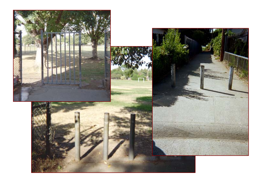
Figure 1: Walkway Examples

• Approximately three walkways leading to schools or park are not ADA compliant (Figure 1).