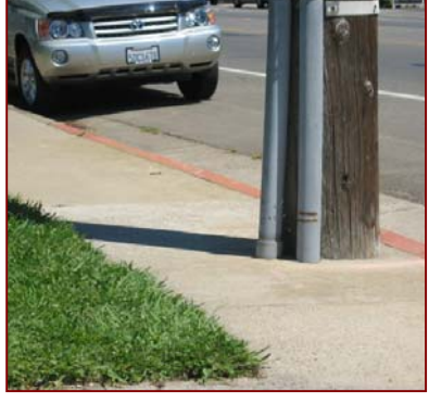
Obstruction Examples - Mather Field Road at the Mather Sports Complex and Senior Center