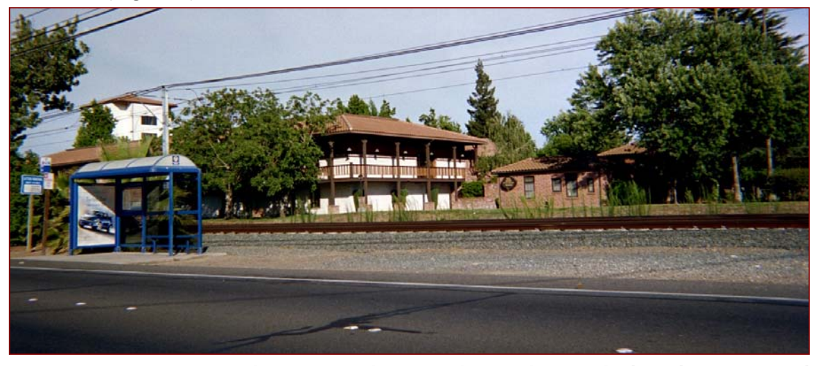
Figure 4: Bus Stop Path-of-Travel Example - Folsom Blvd and Routier Rd

Transit Stop Type : The parameters of the transit stop type are none, light rail, bus and other (Figure 4).